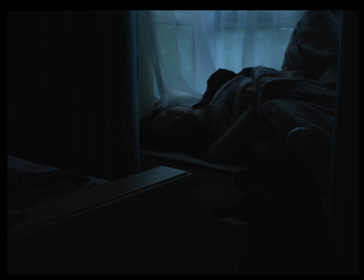
The Good Woman of Sichuan I 2021