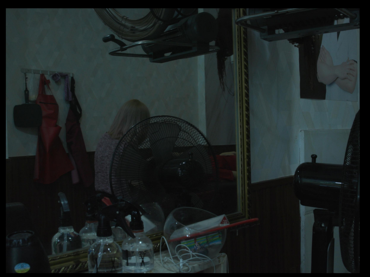
The Good Woman of Sichuan I 2021