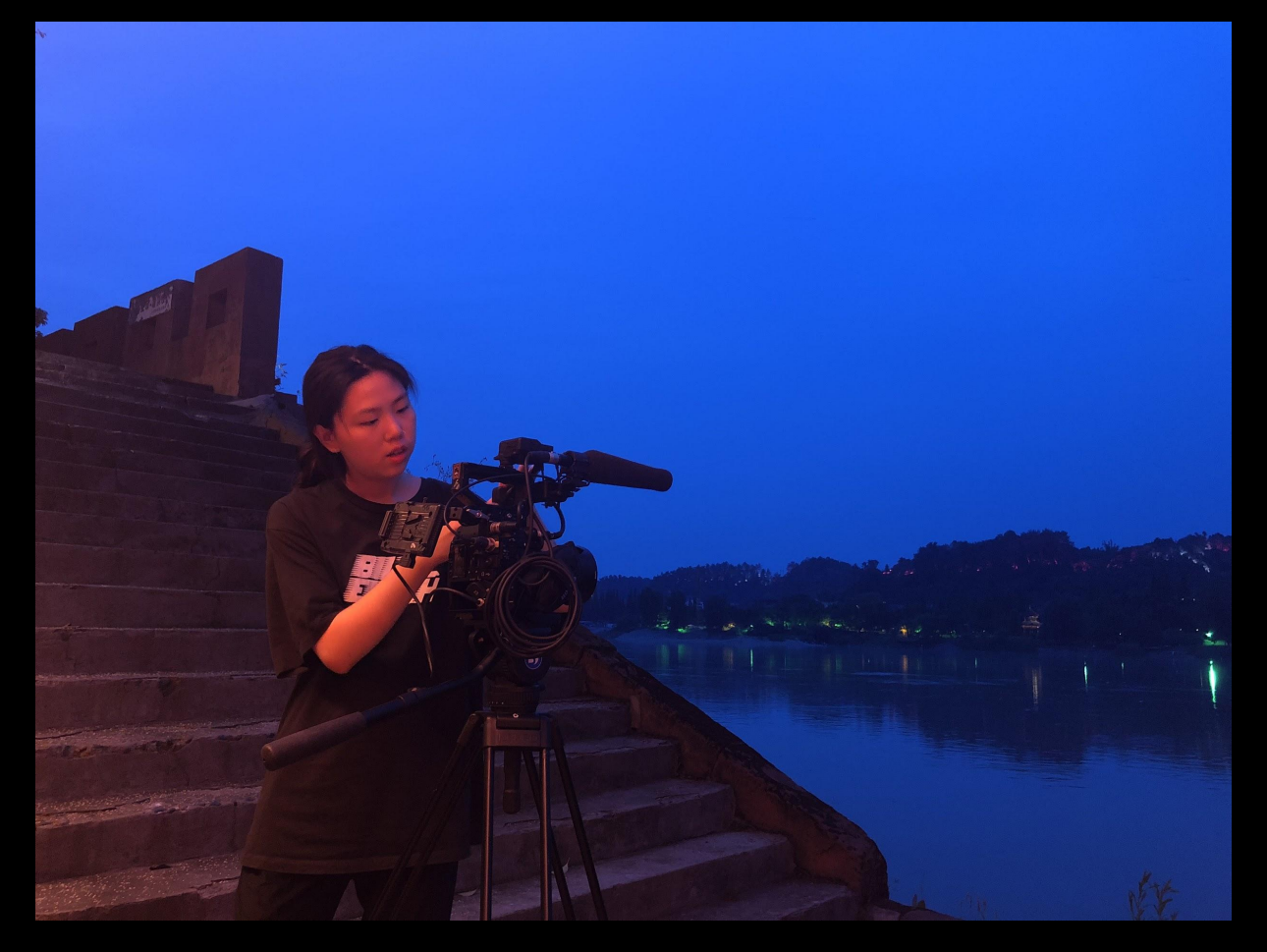
BTS - Cinematographer: Sherry Wu