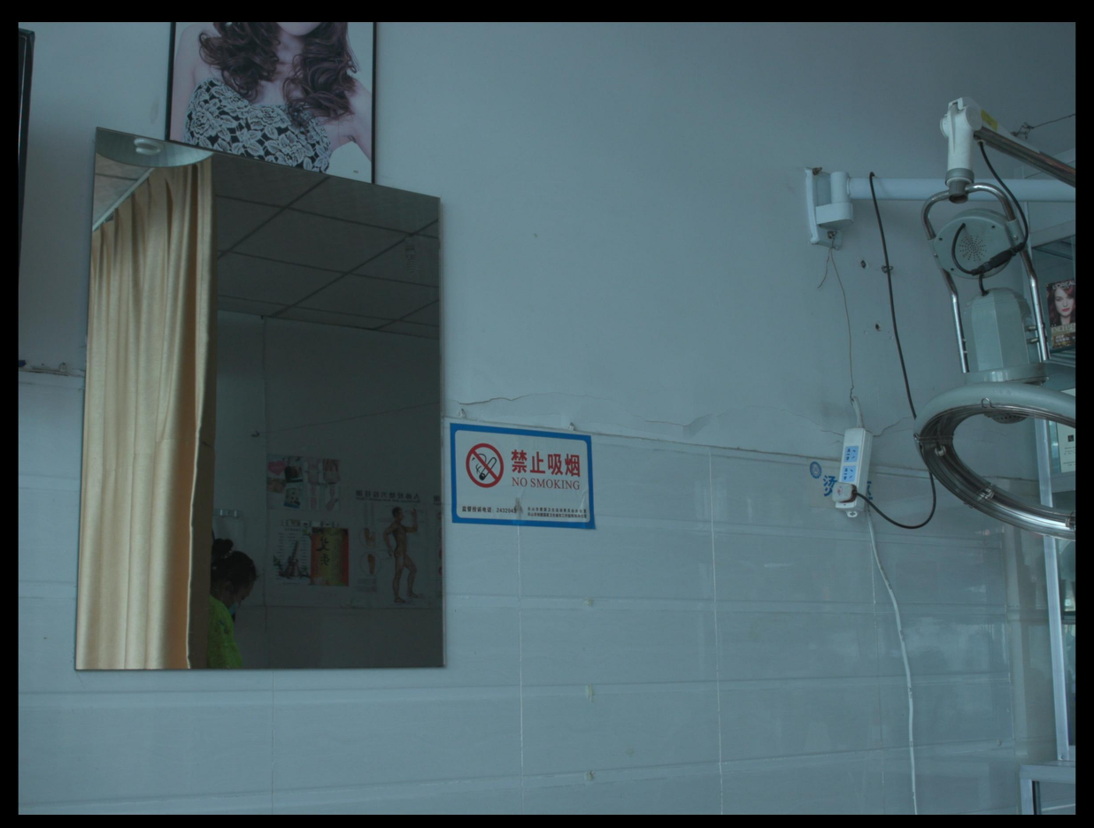
The Good Woman of Sichuan I 2021