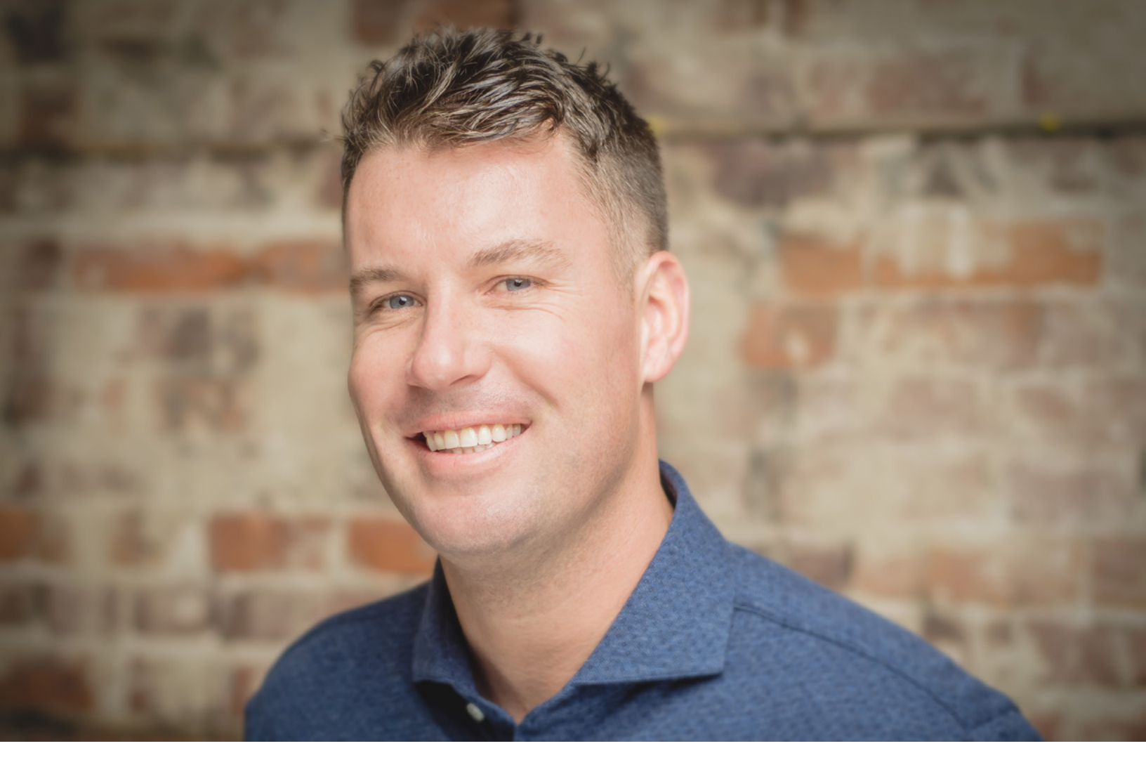
CO-PRODUCTION COMPANY'S PROFILE